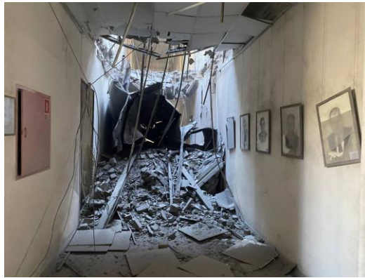
Nikopol, Dnipropetrovsk region