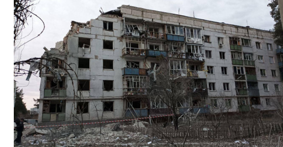
Klugyno-Bashkyrivka, Kharkiv region, 02.11